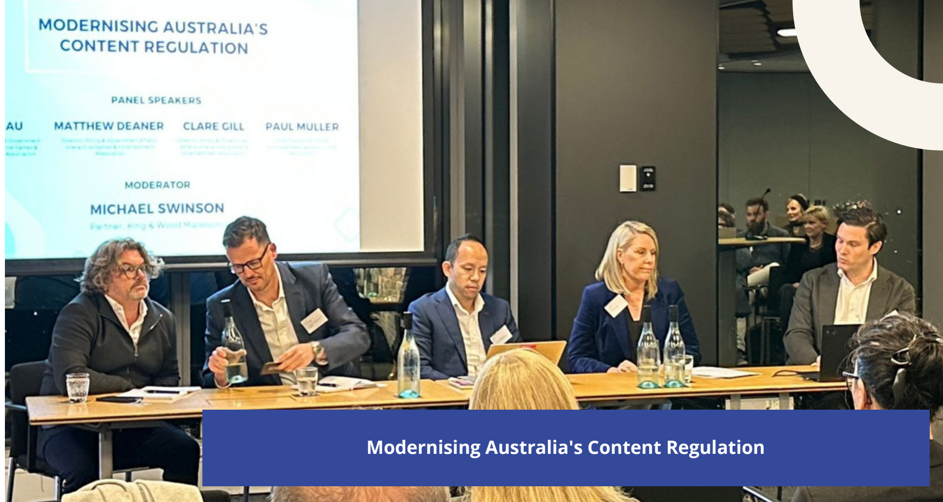
Modernising Australia's Content Regulation