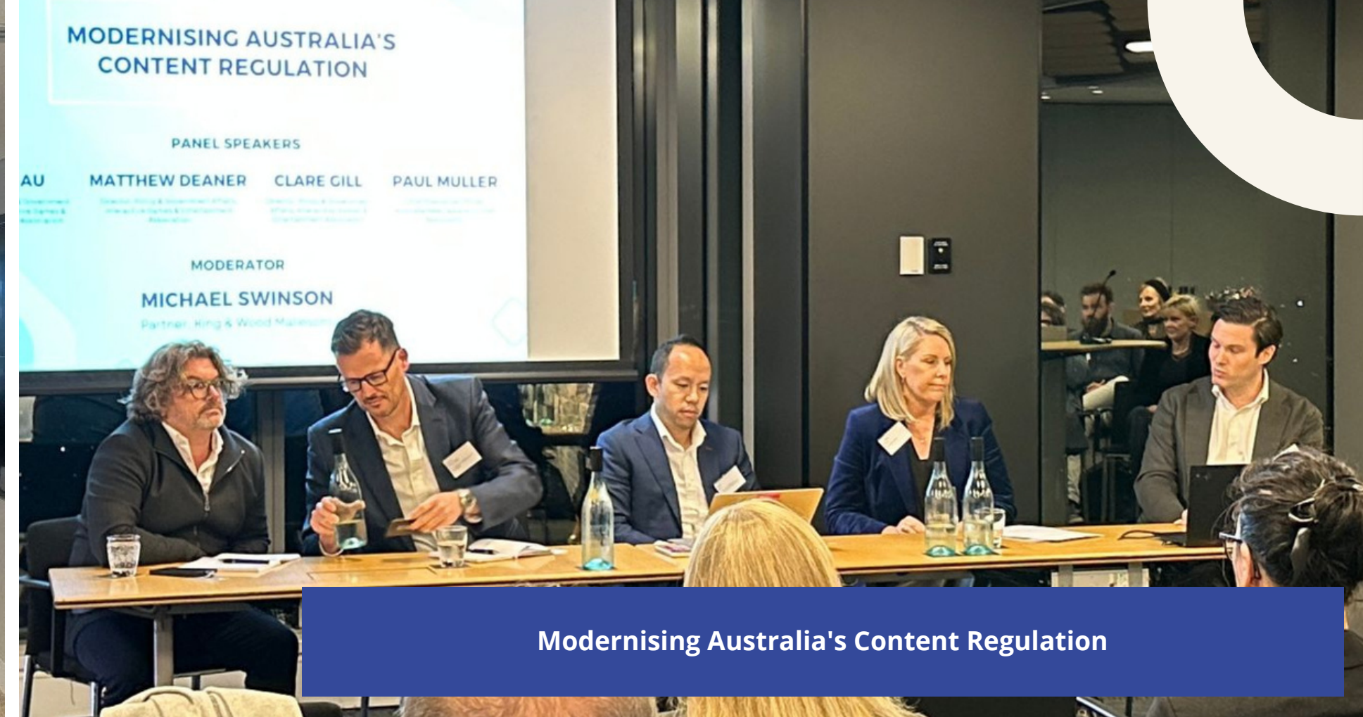
Modernising Australia's Content Regulation