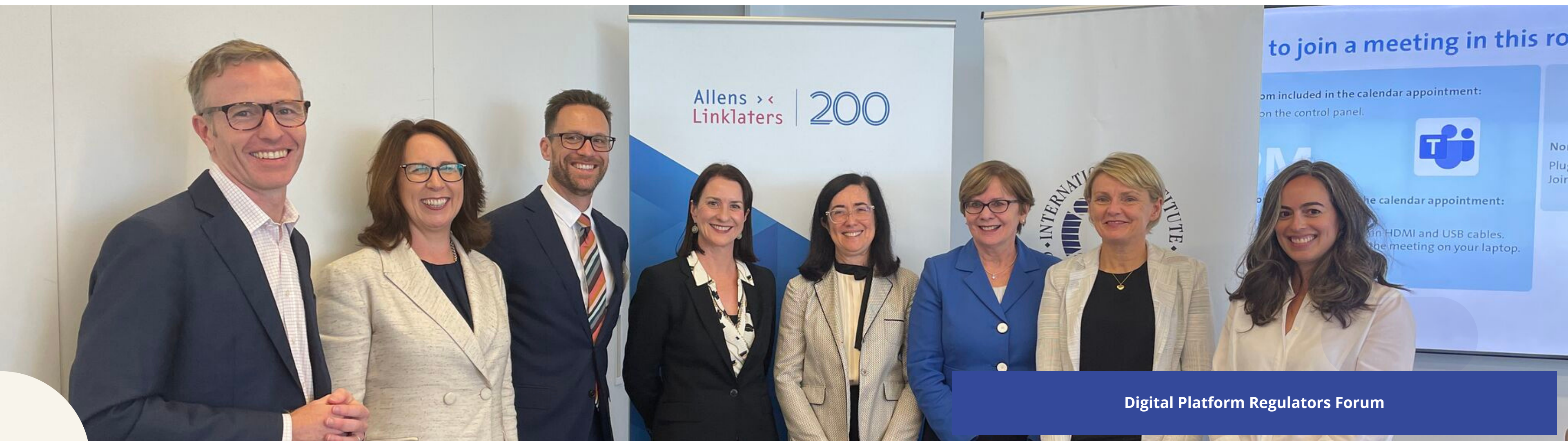
Digital Platform Regulators Forum