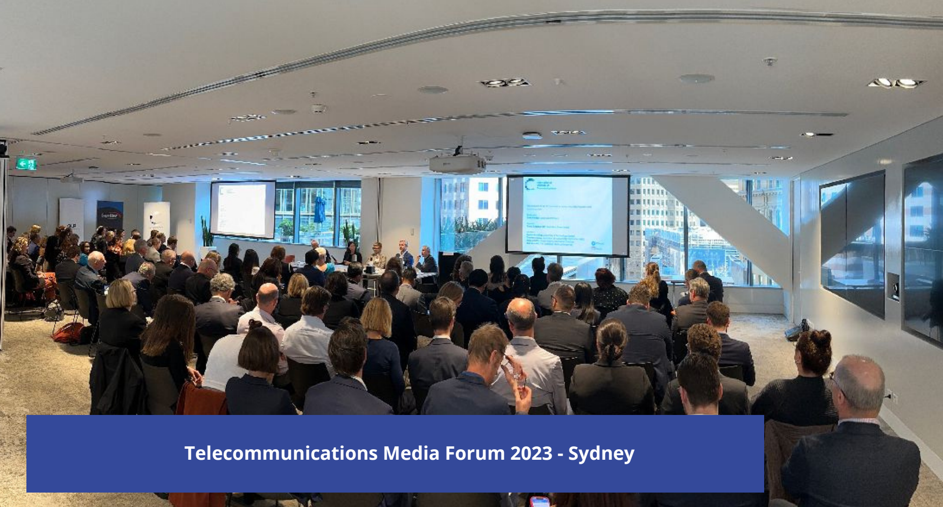
Telecommunications Media Forum 2023 - Sydney