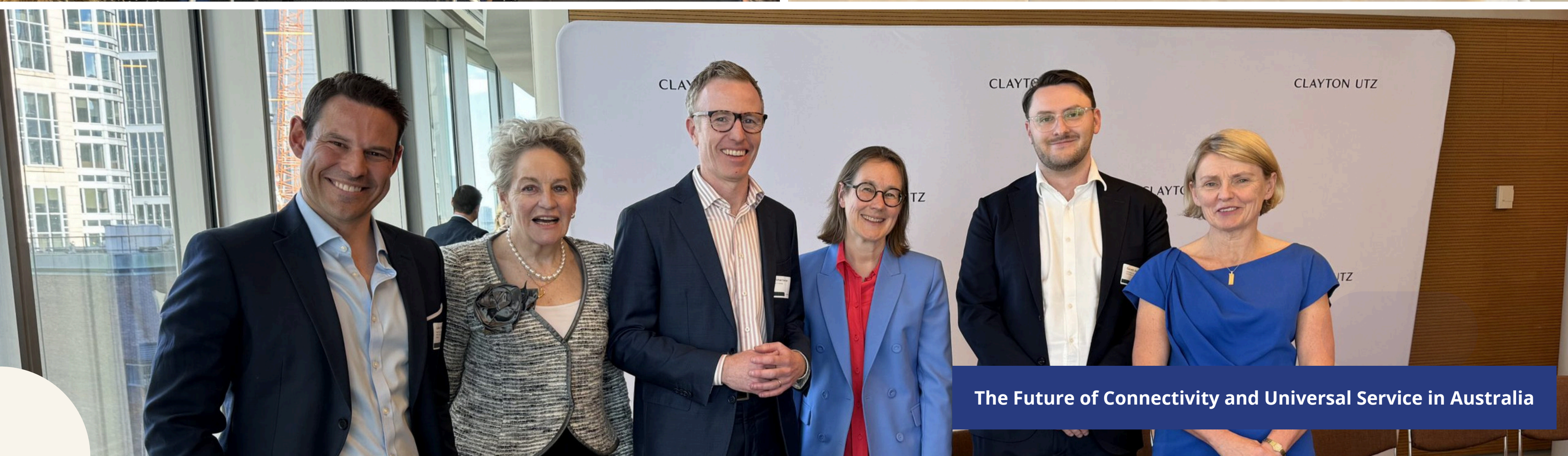
The Future of Connectivity and Universal Service in Australia