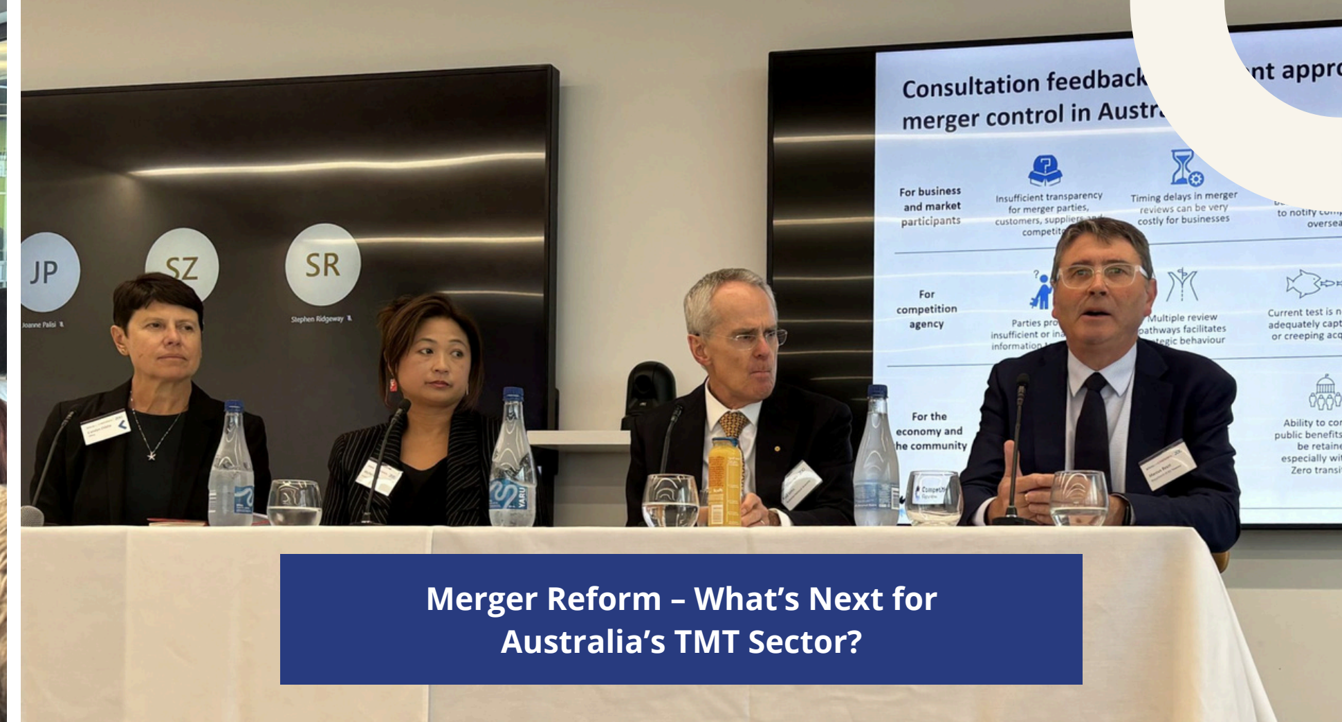
Merger Reform – What’s Next for Australia’s TMT Sector?