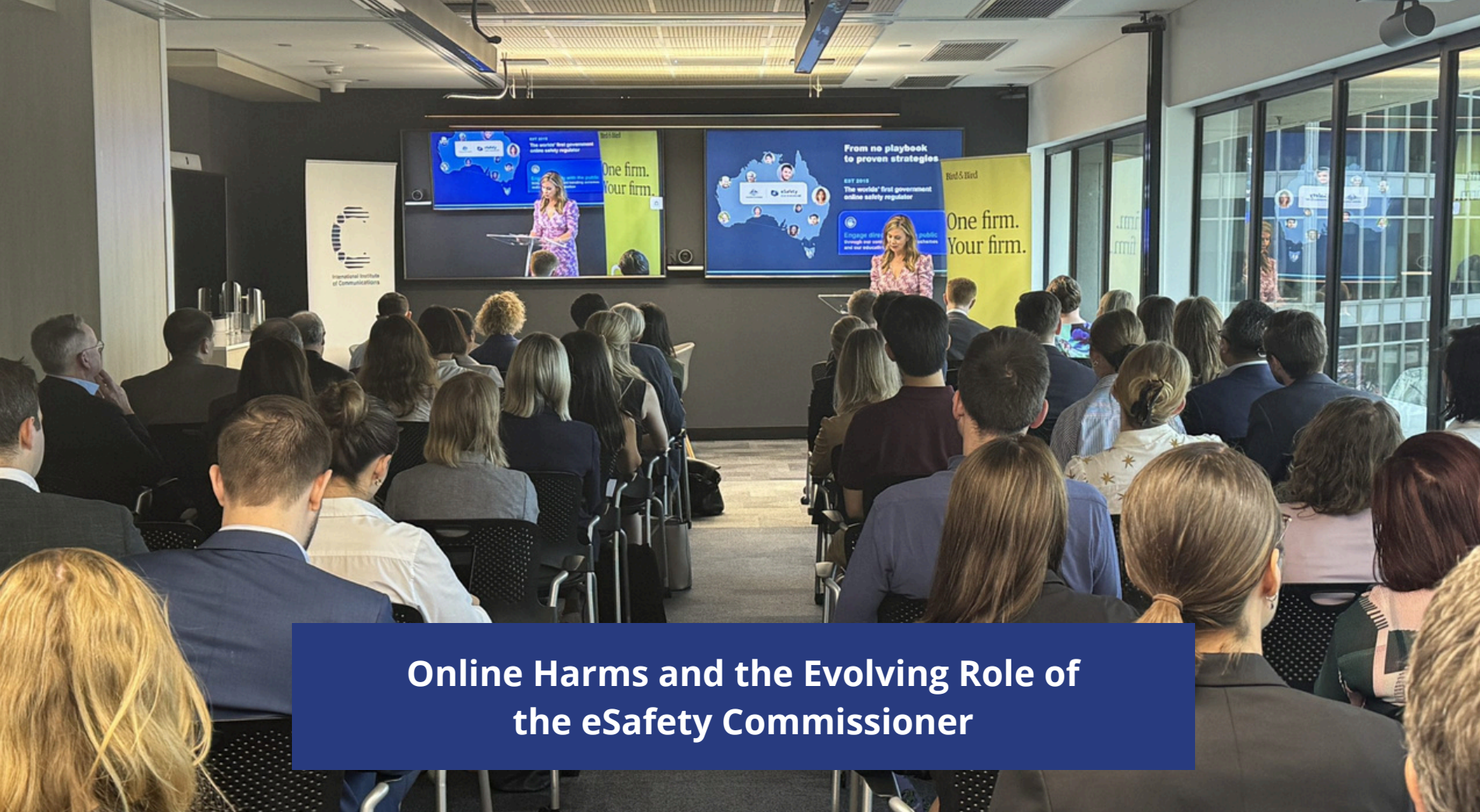
Online Harms and the Evolving Role of the eSafety Commissioner